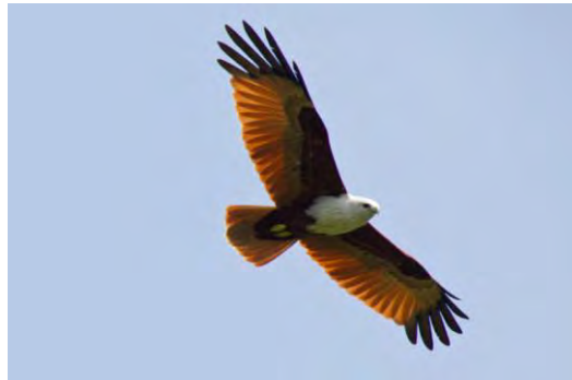
A soaring Brahminy kite.

In March, the Philippines’ DENR halted the transportation of licensed wildlife and forest items in line with the country’s lockdown measures to reduce the transmission of COVID-19. But it says there still needs to be stricter monitoring of illegal wildlife activities during the pandemic.