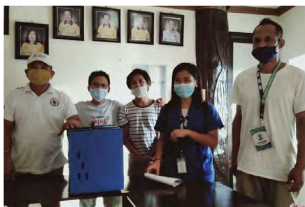
The Brahminy kite hatchlings rescue team.

Representatives from the DENR's Knowledge and Information Systems Services, as well as its offices from eight regions and other law enforcement agencies, identified several glitches during that testing, including in the transmission of reports, notifications, and app crashes.