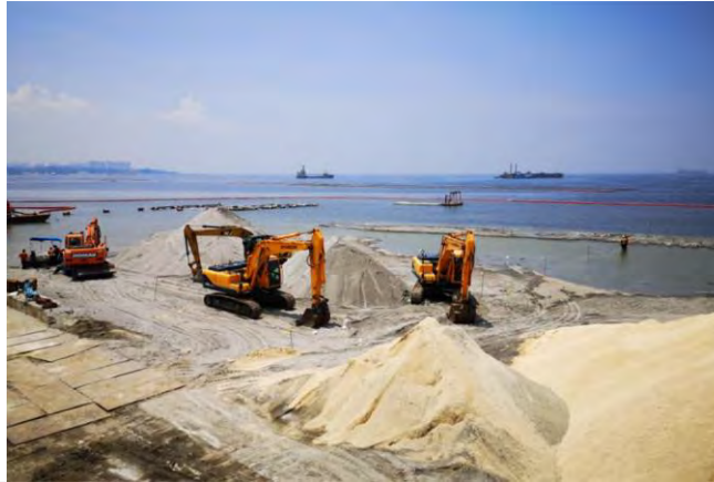
White sand from Cebu are dumped in parts of Baywalk in Manila Bay.

Posted at Sep 03 2020 03:54 PM | Updated as of Sep 03 2020 11:46 PM