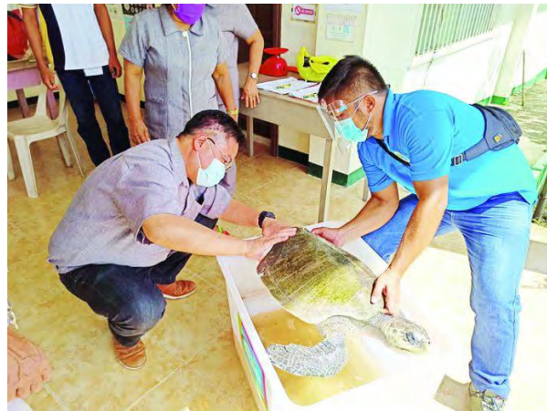
CENRO Bago City staff assists and checks the wound on the hind part of the turned over Olive ridley sea turtle.

By Panay News -Thursday, September 3, 2020