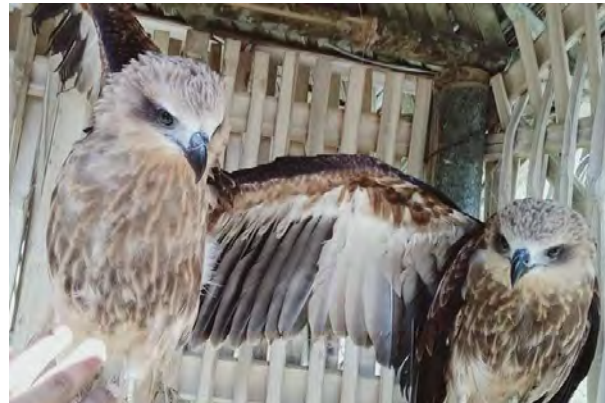
The Brahminy kite hatchlings.

To address the red tape and ease the reporting process, the DENR in March launched a mobile app, though it's not yet available to the public. The Wildlife Agency and Citizen Law Enforcement Reporting Tool (WildALERT) is a centralized system that aims to help DENR employees and law enforcement partners, and eventually citizens in general, identify wildlife species, report illegal activities while in the field, validate and update reports, and monitor the status of wildlife crimes.