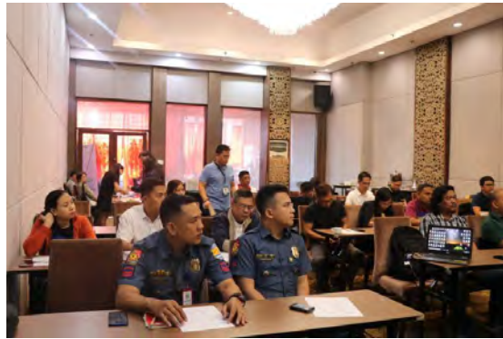
Attendees of the pilot testing of the WildALERT app's beta version.

This is helpful for enforcement officers and citizens in areas with weak or no internet signal. They can enter the information offline and later sent it to the report management platform when they get an internet connection. A data manager will assess the report and then forward it to the nearest DENR office or law enforcement site. This should allow for a quicker response, theoretically in a matter of a few hours.